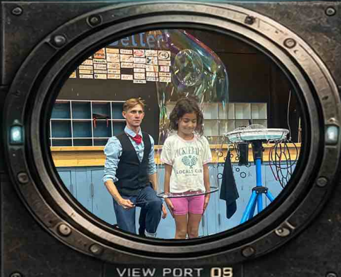
VIEW PORT 08