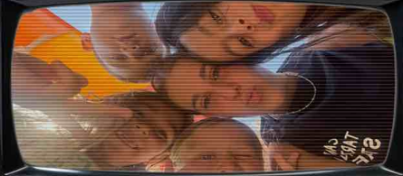
CAM 06 - FRIENDSHIPS