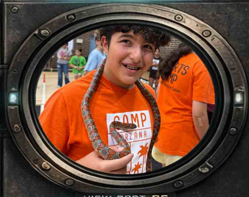
VIEW PORT 06