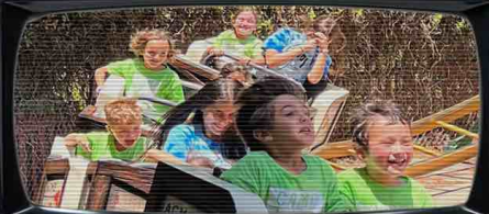
CAM 09 - SIX FLAGS