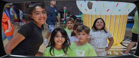
CAM 04 - CANDYLAND