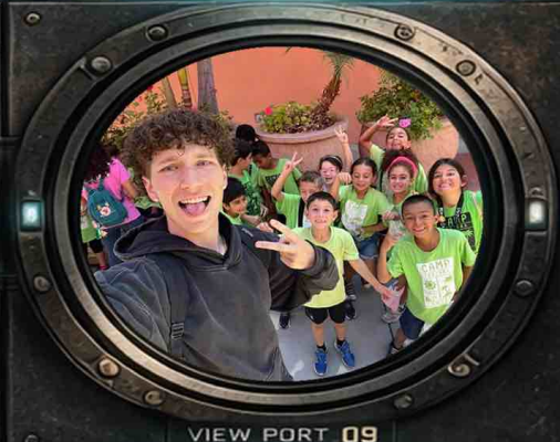
VIEW PORT 09