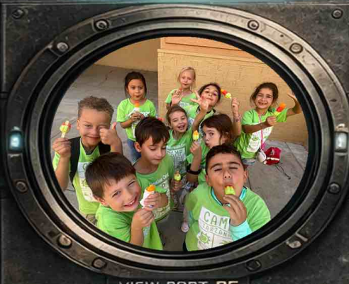
VIEW PORT 05