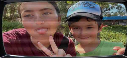
CAM 02 - LOVING LIFE