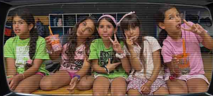
CAM 08 - VIBING