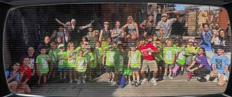
CAM 07 - WATERWORLD