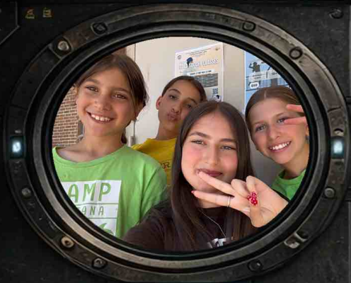
VIEW PORT 01