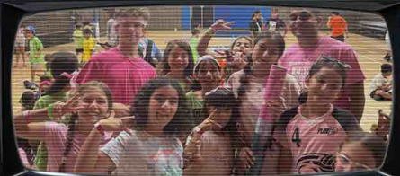
CAM 12 - OLYMPICS