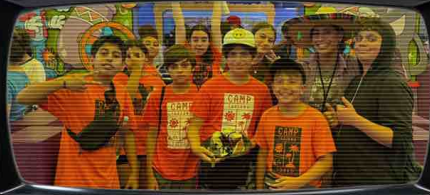
CAM 05 - SIMPSONS