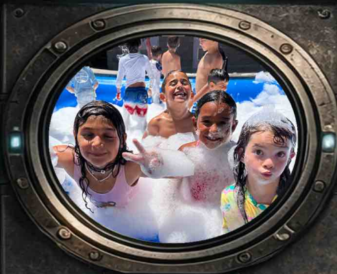
VIEW PORT 02