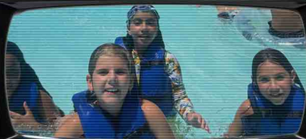
CAM 11 - WILD RIVERS