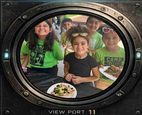
VIEW PORT 11