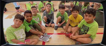
CAM 03 - SMILES