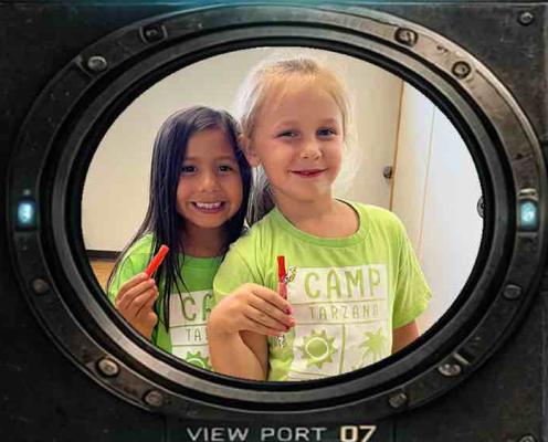
VIEW PORT 07