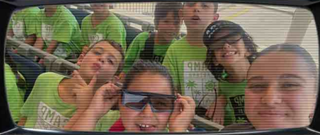
CAM 01 - UNIVERSAL