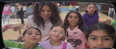
CAM 10 - CRAZY HAIR