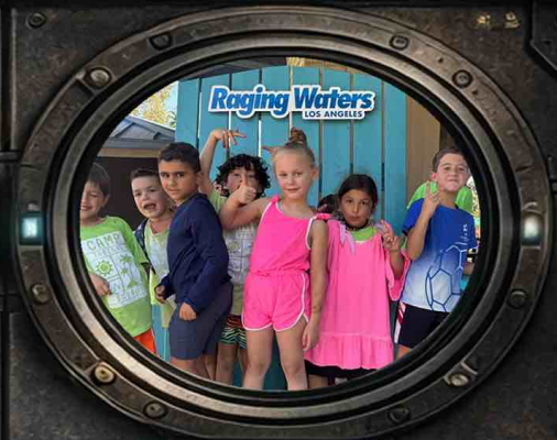
VIEW PORT 03