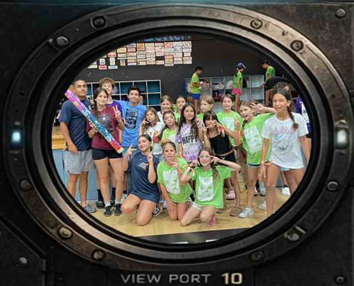
VIEW PORT 10