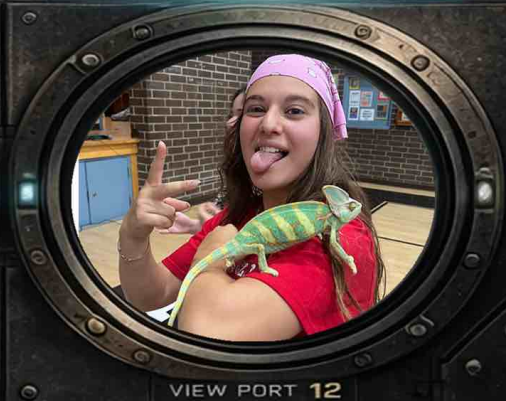
VIEW PORT 12