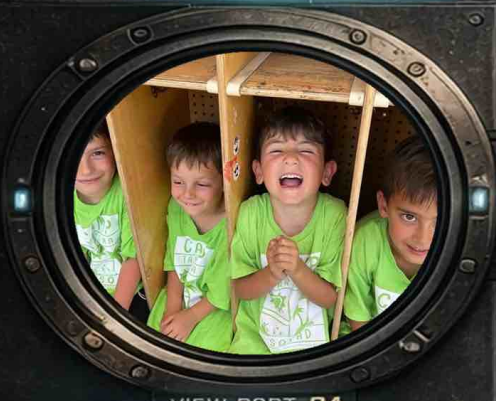
VIEW PORT 04